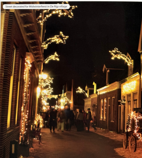
Street decorated for Midwinterfeest in De Rijp village